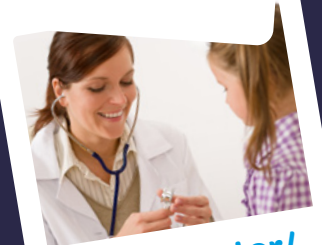
✓ A Doctor/Nurse